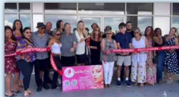
MAKE ME OVER