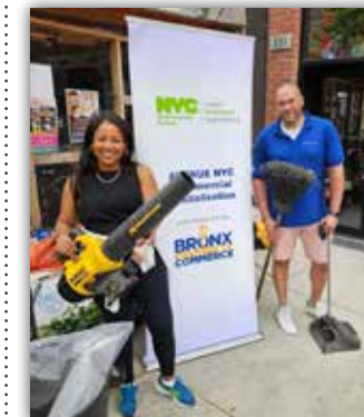
GOTHAM TRIANGLE CLEAN UP