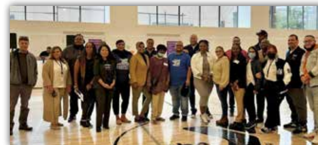
SECURE THE BAG - BUSINESS RESOURCE FAIR