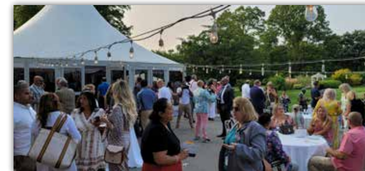
SUMMER BBQ RECEPTION