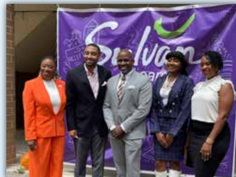
SYLVAN LEARNING CENTER