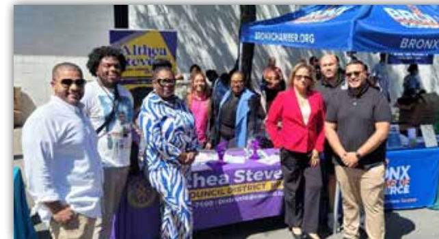
BACK TO SCHOOL COMMUNITY EVENT WITH COUNCILMEMBER ALTHEA STEVENS