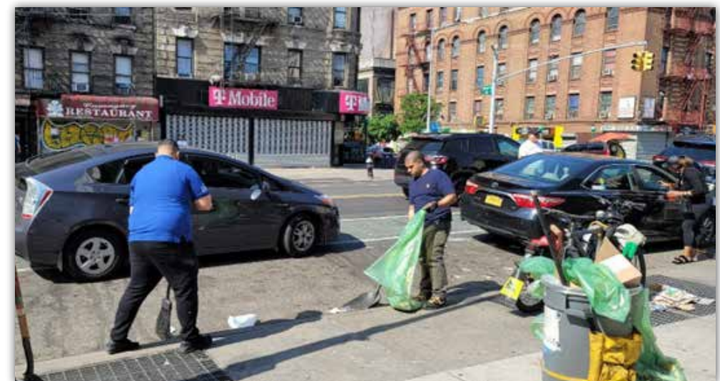
138TH CLEAN UP