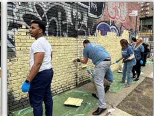
JEROME AVENUE CLEAN UP