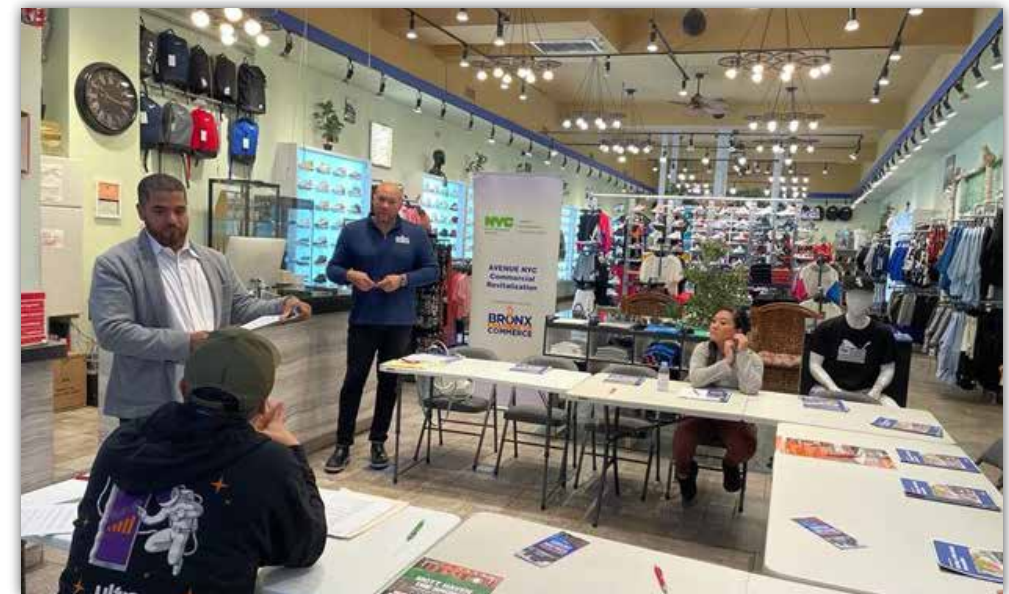
138TH MERCHANT MEETING

Today, the 138th Street Merchants Association continues to evolve and grow. With plans for execution in 2024, this compassionate community-led effort is a testament to the resilience and determination of the people who call this vibrant neighborhood their home. They have proven that through unity and unwavering compassion, a brighter, safer, and more beautiful community is not just a dream—it's an achievable reality.