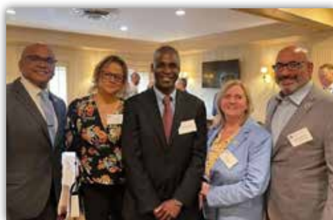
BRONX CHAMBER IN WASHINGTON, DC