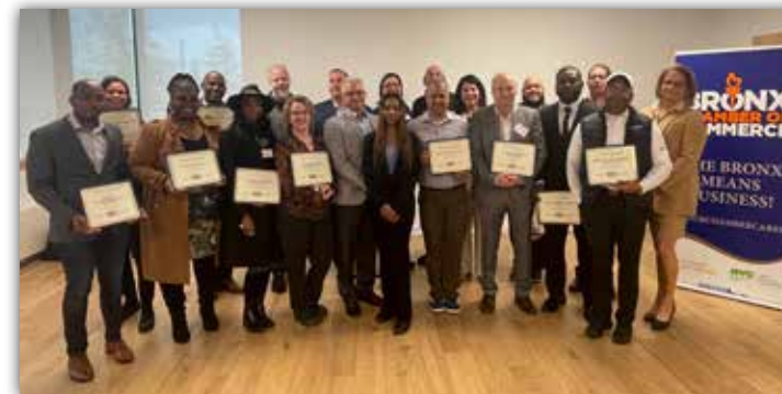
SPRING NEW MEMBER BREAKFAST