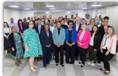
5 BOROUGH CHAMBER ALLIANCE BREAKFAST WITH SPEAKER ADAMS