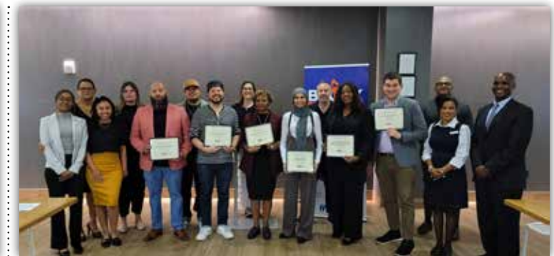
FALL NEW MEMBER BREAKFAST