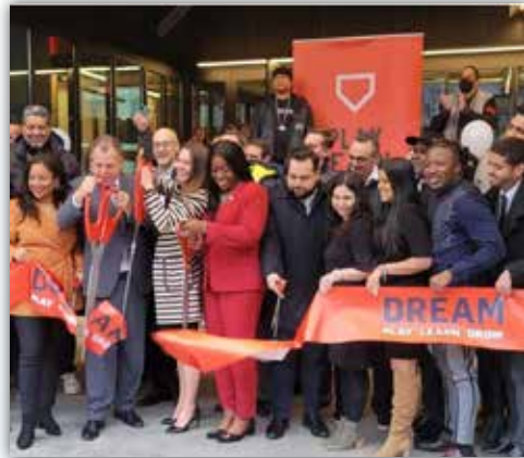
DREAM CHARTER SCHOOL