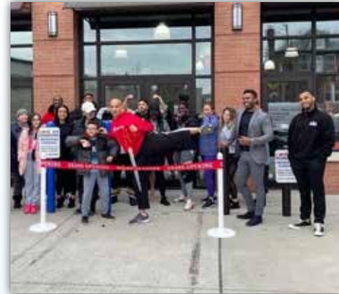
I LOVE KICKBOXING