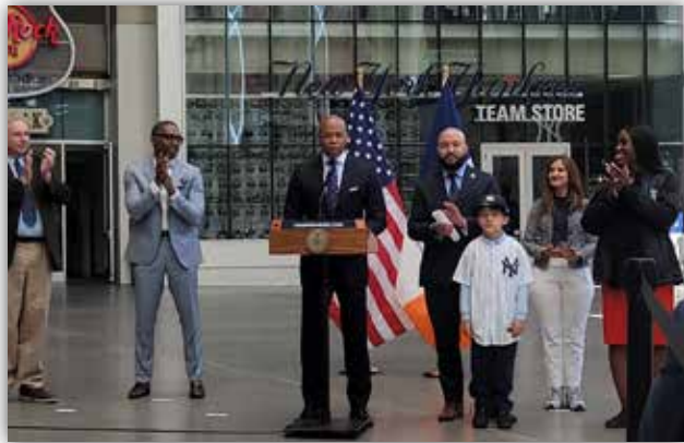
MAYOR ERIC ADAMS SIGNS BILL

This past year, the Bronx Chamber of Commerce has been actively involved in several key legislative initiatives. They advocated for increased funding for small businesses, supported infrastructure improvements, and pushed for policies that promote job creation and economic growth in the Bronx. Additionally, the Chamber has furthered dialogue between Bronx businesses and elected officials, strengthening relationships and ensuring the concerns of the business community are heard. These efforts have helped create more opportunities for businesses to thrive and contribute to the borough's economic prosperity.