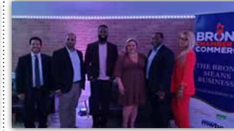
B2B NETWORKING WITH COUNCILMEMBER MARJORIE VELAZQUEZ