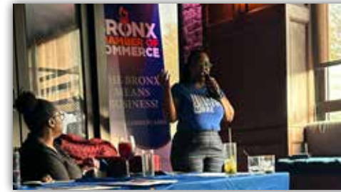
B2B NETWORKING WITH COUNCILMEMBER ALTHEA STEVENS