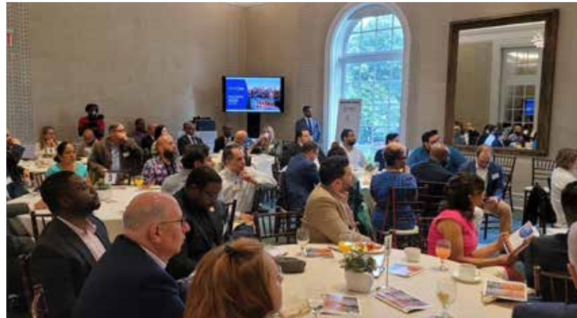
BRONX CHAMBER MEMBERS ATTEND LEGISLATIVE BREAKFAST WITH STATE AND CITY ELECTED OFFICIALS