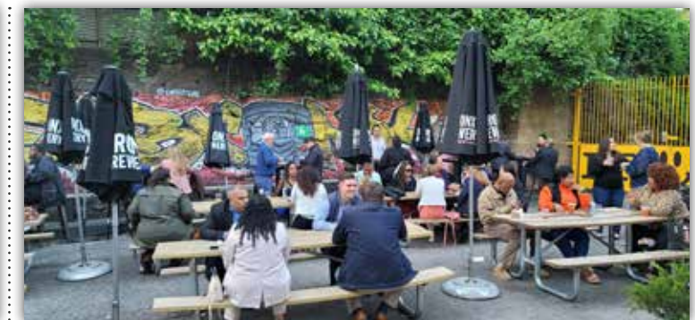
EXPLORING MAKERS & BREWERIES NETWORKING EVENT