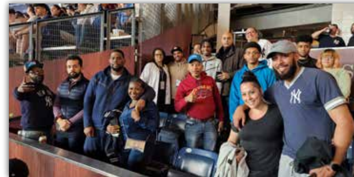
GAMECHANGERS NIGHT AT YANKEE STADIUM